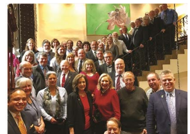
New Supervisors Class of 2016-17

The three sessions of the Institute provide a unique venue for new County Supervisors to meet their colleagues and learn important information, protocols and practices to help them better understand the requirements and environment of their new office. The Institute is designed to complement orientations offered by the county.