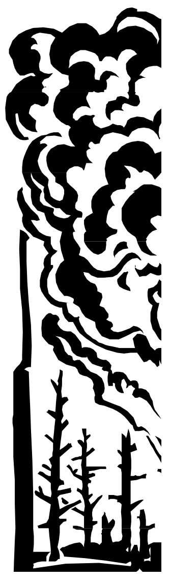
smoldering stages of a fire.

Smoke events often catch us off-guard. This guide is intended to provide local public health officials with the information they need when wildfire smoke is present so they can adequately communicate health risks and precautions to the public. It is the product of a collaborative effort by scientists, air quality specialists and public health professionals from Federal, state and local agencies.