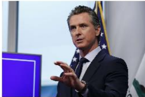
Gov. Gavin Newsom changed course on public health funding.

Angela Hunt July 5, 2021 | Updated July 5, 2021 6:06 AM