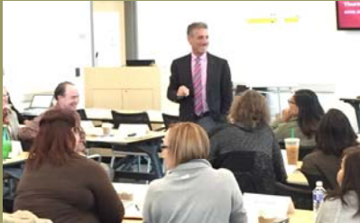
Participants examine current issues and best practices in group discussions

Demonstrate your commitment to continuing your education by earning a credential from CSAC Institute.