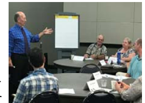
Expert faculty with real-world experience share their knowledge in each class

A special discounted Credential Package is available for $1,299. This allows participants to enroll in eleven courses; which includes an extra class. To take advantage of this offer, click on "credential package" when enrolling for your first class. Subsequent course enrollment will not require payment.