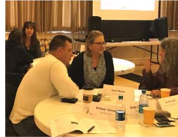
Practical application and active learning highlight Institute courses

Courses offer practical approaches and "take home" value in a class setting which encourages interaction with peers and shared learning.