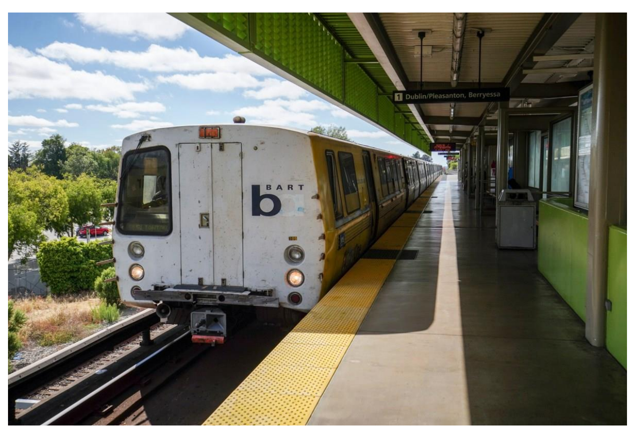
A Bay Are Rapid Transit train waits in station on July 3, 2022.