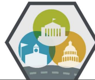
WORKFORCE & CIVICS EDUCATION

At ILG, we envision a California where all local government leaders are trusted by the people they serve because of excellent leadership and the endless pursuit towards thriving and resilient communities. We are honored to partner with like-minded organizations to provide California public servants with the support and resources they need to navigate their complex and evolving leadership roles. ■ ■ ■