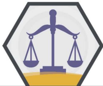
LEADERSHIP & GOVERNANCE

ILG provides education and training to local government leaders in the form of webinars, workshops, consulting services and written resources. We are experts in technical assistance, facilitation, capacity-building, hosting convenings and more. All our work is guided by our core values of collaboration, service, commitment, equity, inclusion and trust . Our education and training programs cover four main pillars of work: