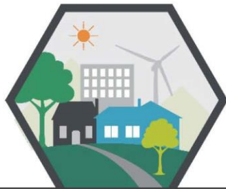
SUSTAINABLE & RESILIENT COMMUNITIES